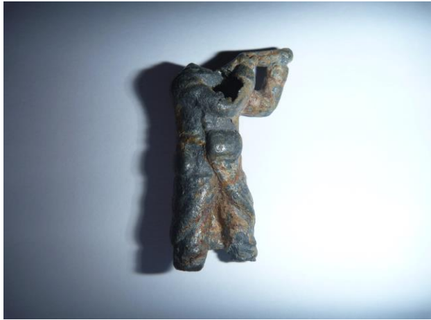
Marine Figurine1 (Finder - M Pearce)