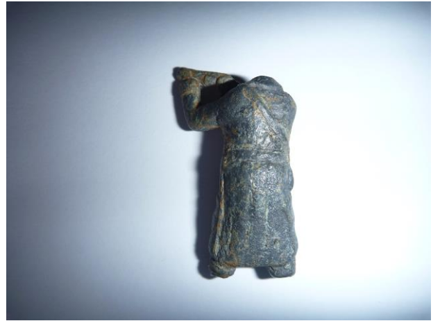
Marine Figurine Fragment 2 (Finder - P Aldersley)