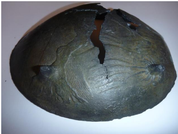
Pewter Dish 2015