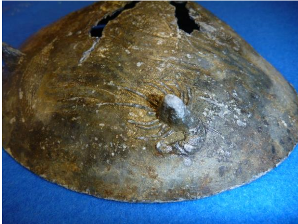
Pewter Dish 2014