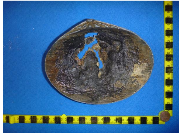
Pewter Dish 2014