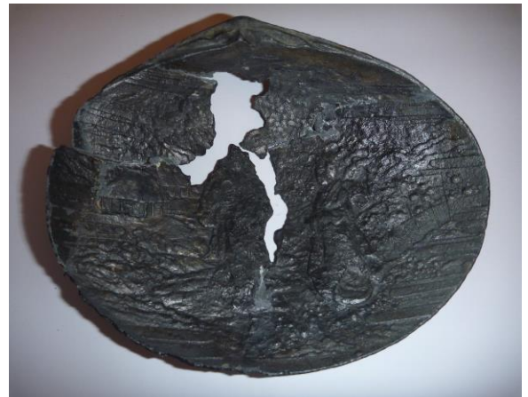
Pewter Dish 2015